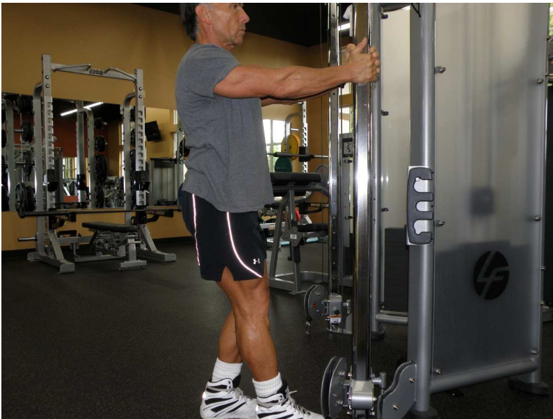
Back Stretch Position 2