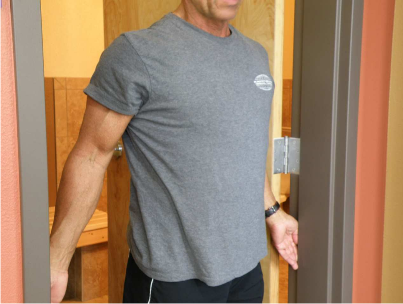
Chest Stretch Position 2