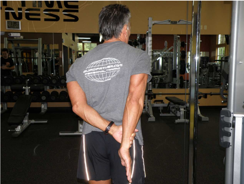
Shoulder Stretch Position 2